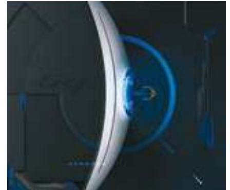
MONITORS TO SELL IN YEAR 2021