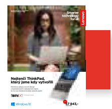
Back cover 225 x 300 mm Price: 120 000 CZK