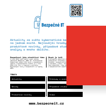
Cover inside (II. a III.) 225 x 300 mm Price: 110 000 CZK