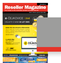
Exclusive banner 225 x 35 mm Price 45 000 CZK