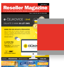
Cover page 225 x 215 mm Price: 145 000 CZK