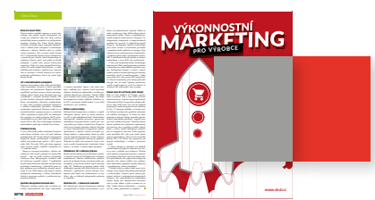
Full page 225 x 300 mm Price: 85 000 CZK