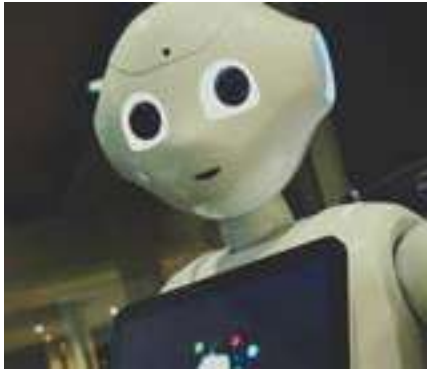
TECHNOLOGIES AND INNOVATION OF HARDWARE IN 2021