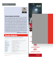
1/3 pages in height [editorial] 75 x 300 mm Price: 40 000 CZK