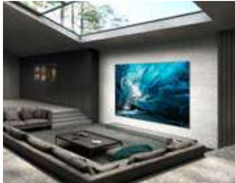
HOT NEWS FROM THE WORLD OF TELEVISION