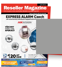
Magazine insert Price: 6 CZK/piece to 20g